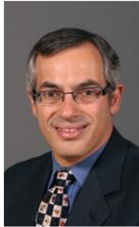
Industry Minister Tony Clement