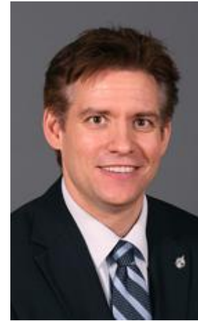
Parliamentary Secretary to Industry Minister Mike Lake