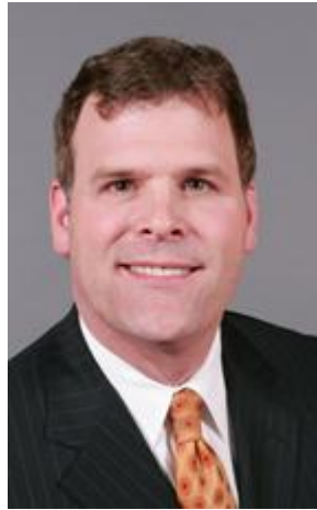
House Leader John Baird